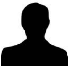
ANAS AREMEYAW ANAS