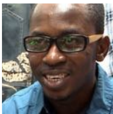
DIXON Spokesperson Traders' association "African Community Hong Kong"