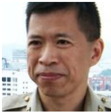
VINCENT WONG Superintendent Hong Kong Customs