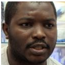
H-C Nigerian trader