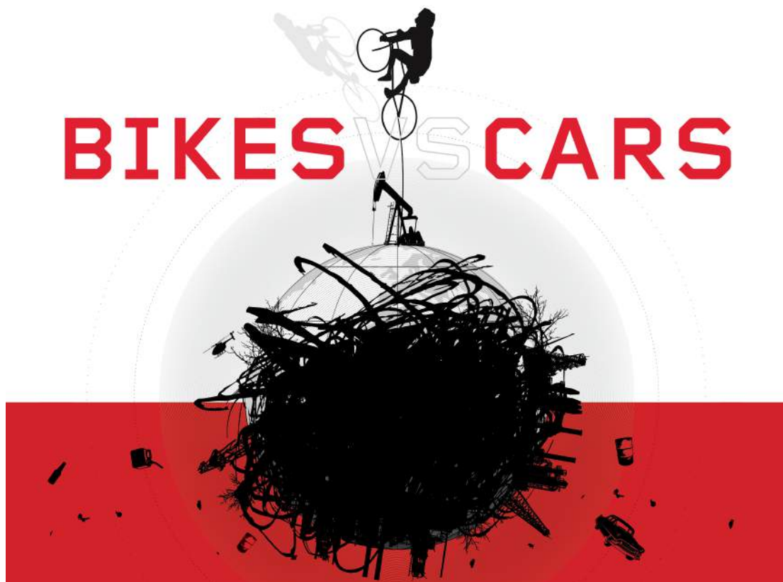
BIKES vs CARS Title image 1. Design: Rebeca Mendes