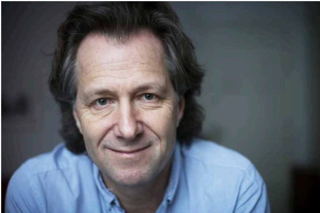
Director Fredrik Gertten.