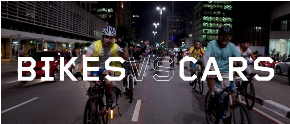
BIKES vs CARS Title image 2; Ghost bike memorial ride, São Paulo, Brazil.