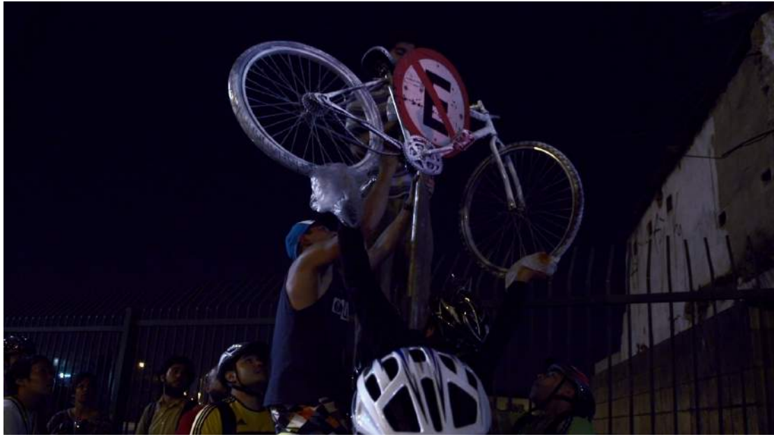
Ghost bike memorial ride, São Paulo, Brazil.