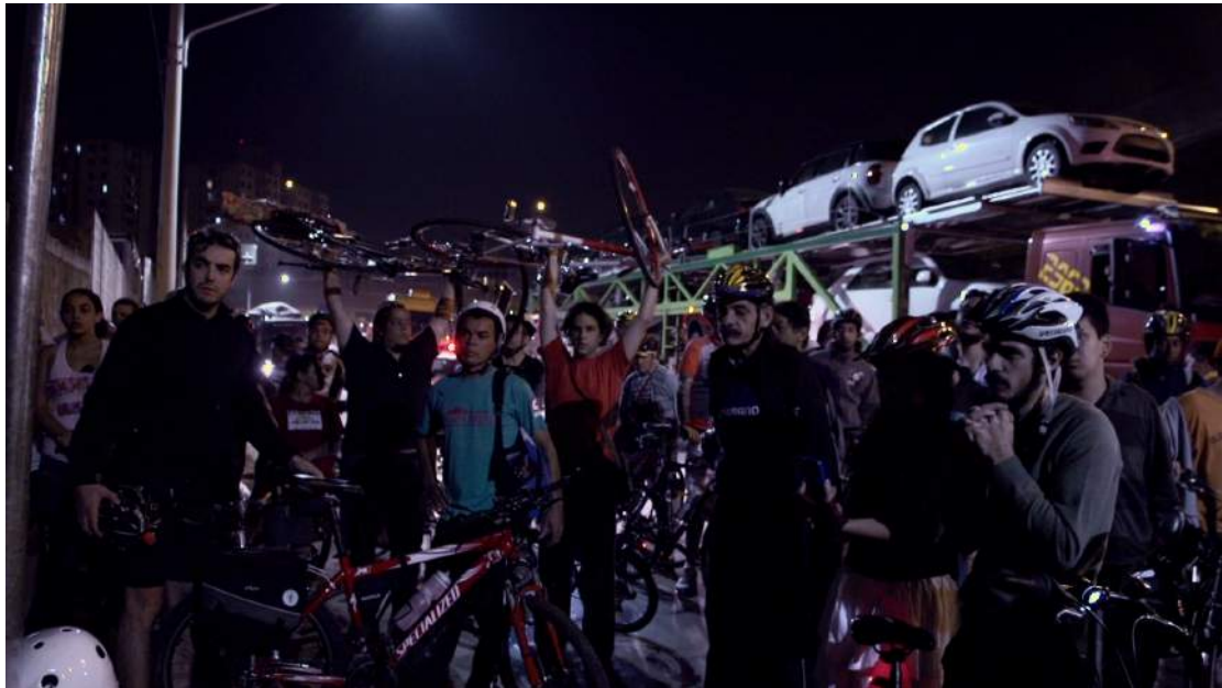
Ghost bike memorial ride, São Paulo, Brazil.