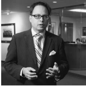
Denzil Minnan-Wong Deputy Mayor, Toronto